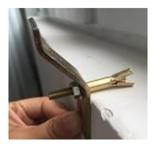
Fit the washer and nut and tighten until secure