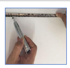
Mark the centre dimensions on the wall