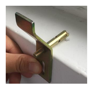
Place the bracket over the thread