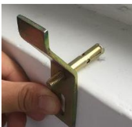
Place the bracket over the thread