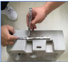
Measure the centre dimension between the slots on the basin