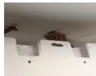
Hang the basin onto the brackets, silicone or adhesive can be used in conjunction with the fixings