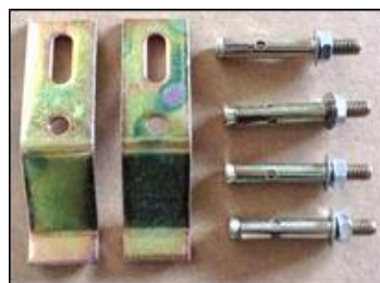
Remove nut and washer from fixings