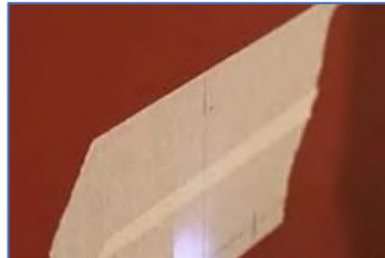
Mask the wall where the installation is to be carried out, to protect the wall finish