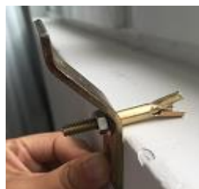
Fit the washer and nut and tighten until secure