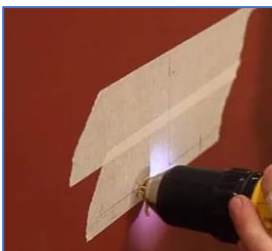
Drill wall to a depth of 12mm