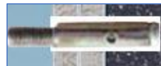
Insert the fitting into wall, leaving the thread exposed by 8 - 10mm