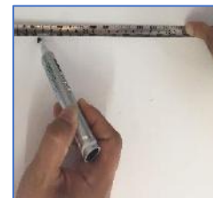
Mark the centre dimensions on the wall